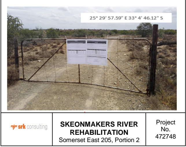
Figure 8 Somerset East 205, Portion 2