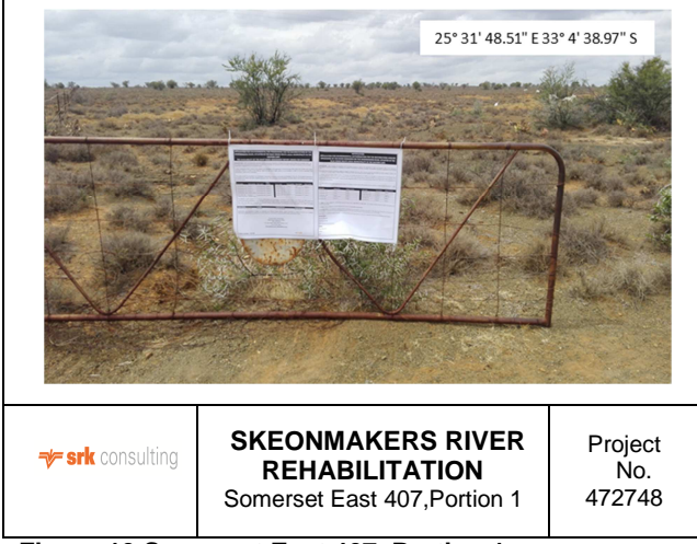
Figure 10 Somerset East 407, Portion 1