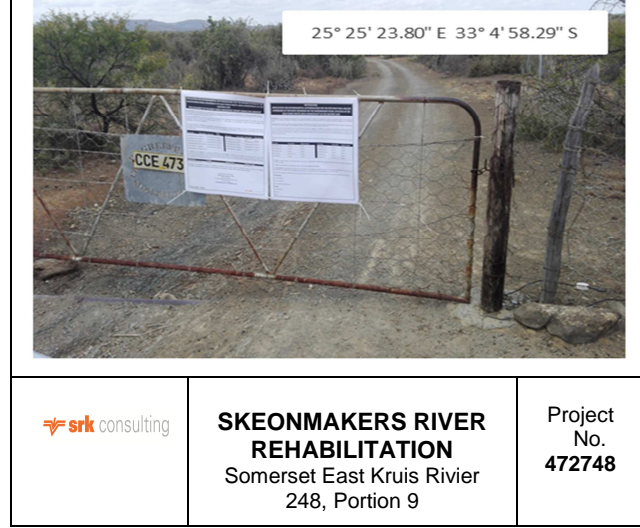
Figure 9 Somerset East Kruis Rivier 248, Portion 9